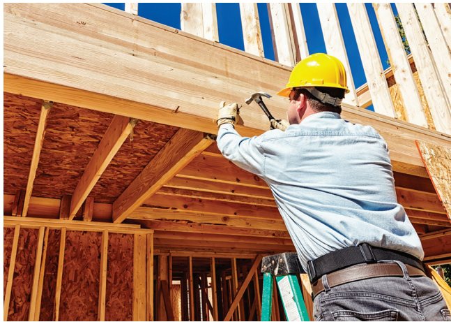
International Builders' Show February 19-21, 2019 • Las Vegas, NV Booth #SU1231

app for that! Yes, really! Download the IBS app* to your smartphone and let it be your guide to everything at the Builders' Show. To find RWC, simply type Residential Warranty Company in the app's search feature and you'll be directed to the link. There's even a map that will direct you right to the booth!